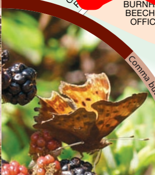
Comma butterfly on blackberries

Schedules 1 & 2 apply to whole site I.E. remove faeces and max of 4 dogs per owner.